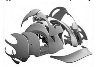
Exploded drawing, LDS, UK

Taken together, this appears to be a reasonable assumption. CAD, by its nature, is a process of vertical construction. Representations are built vertically. The designer appears to be constrained by the algorithmic