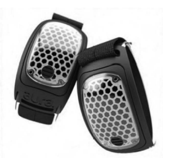
Design concepts, LDS, UK