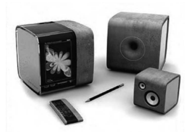
CAD concept rendering, LDS, UK

In this regard the successful use of CAD or any other design tool in the development of creative design solutions depends not so much on the inherent qualities of the tools themselves, but upon the designer's own skills, knowledge and judgment with regard to their use in support of the competing requirements of divergent exploration and convergent specification. Within this context, the tool itself, its affordances and limitations, are at the bequest of the tool user. Tools of design representation, CAD included, are deployed with informed skill, judgment and expertise. In this context the tool and its influence upon practice, quickly becomes inconsequential as the skills and judgment of the designer or design engineer take precedence. That is, the tool and any influence it may have upon the representation of design intent, is critically subject to the expert judgment of the skilled practitioner.