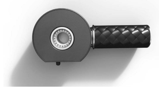
CAD concept model by Hyun Bin Kim

of thinking it involves. We commence our discussion with a short summary of the key principles and concepts that serve to underpin an understanding of the nature of design and the act of designing. We then contexualise CAD's role and use within this conceptual framework and consider its influence upon creativity. We conclude by arguing against what we see as a circular and limiting narrative that focuses on the strengths and limitations of CAD as a tool for creativity. Instead we propose a re-orientation that emphasises the designer as tool user and their expertise, skill and judgment in choice and use of various CAD tools. We conclude with a call for more work on understanding design expertise and the implications skilled judgment has for tool use and creativity in design.